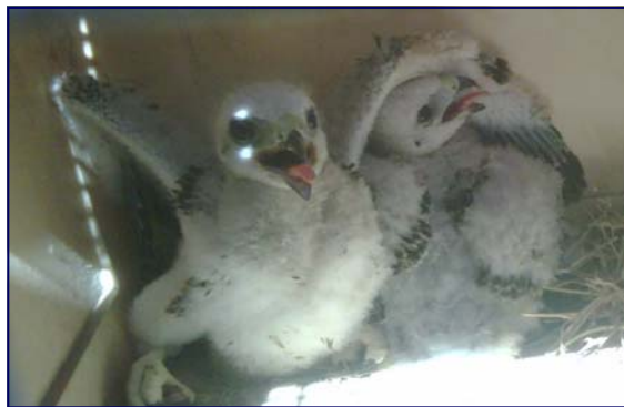
June 22, 2011 Hawk Chick Rescue - 533 B Shift

an evaluator during their testing processes. She has also been working on fire district related legislative issues, including the Prop 13 ballot initiative, and meeting with the Yavapai County Assessor with regard to some property valuation concerns.