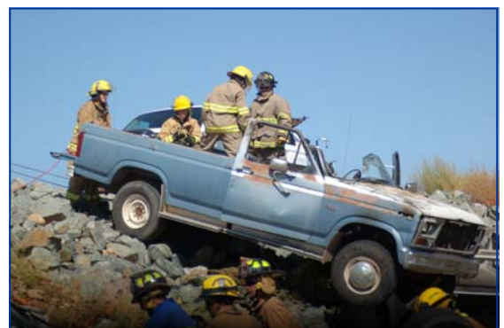
A.X.E.S. 2010 CLASS