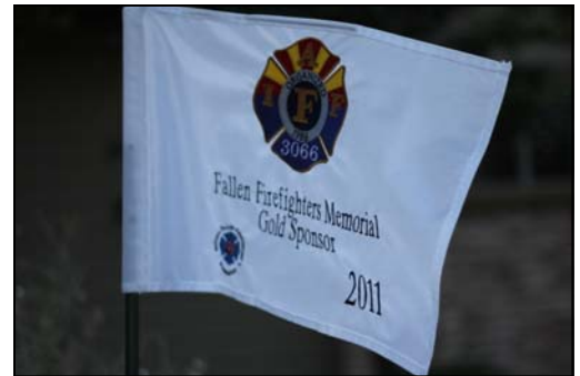
IAFF 3066 Gold Sponsor